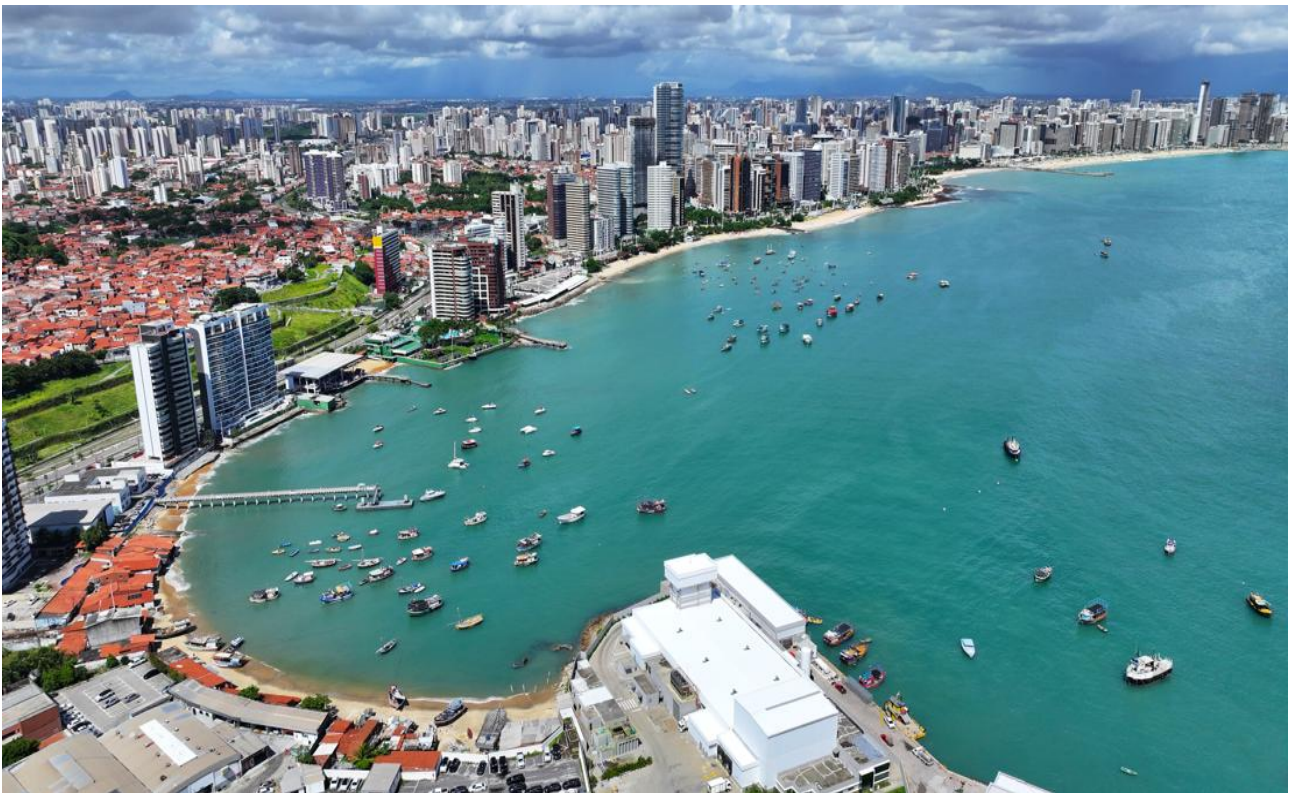
Fortaleza, Brazil.

September 9 to 11, 2026, Fortaleza, Brazil