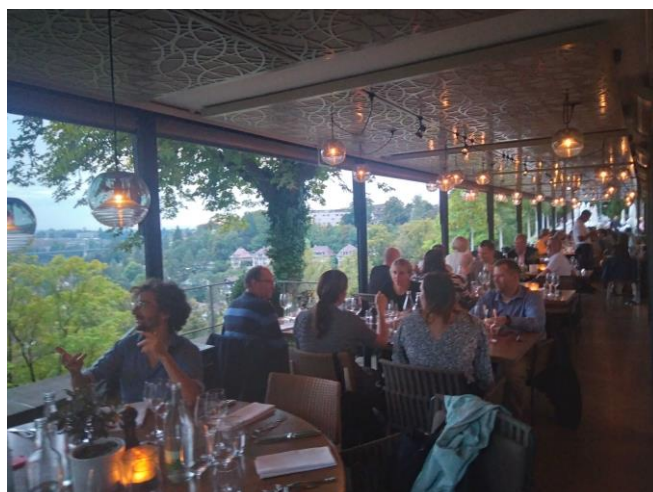
Conference dinner at Rosengarten Restaurant in Bern