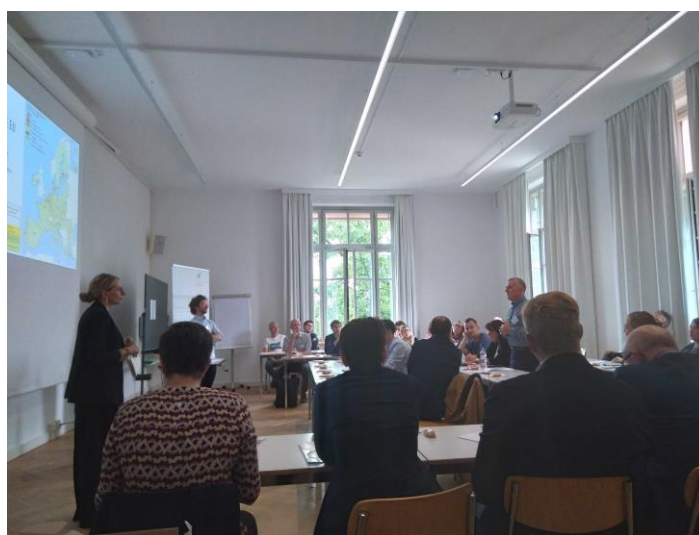
Photo 2. Discussion after presentation