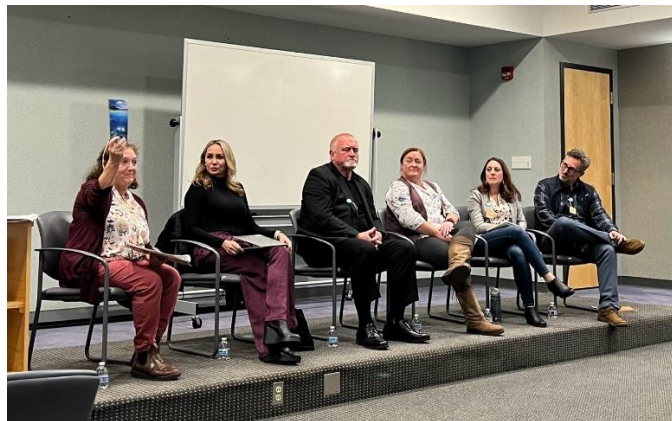
2023 Coastal Transitions Panel Session