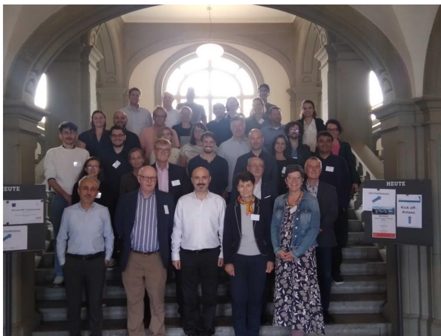
Photo 1. Participants of the Bern Conference.

a. Between 13-15 September 2023, the Commission held its traditional annual mini conference. To some extent, we made history because the Commission held its annual conference in Switzerland for the first time. The conference venue was the University of Bern. The topic of the conference was: 'RETHINKING THE ECONOMIC GEOGRAPHY OF SMALLER URBAN PLACES: TRANSFORMATION AND WELL-BEING IN SMALL AND MEDIUM-SIZED TOWNS'. The local organizer was the Institute of Geography and Center for Regional Economic Development of University of Bern in co-operation with the Anton Melik Geographical Institute, ZRC SAZU, Ljubljana (Slovenia). There was an extremely high interest in the topic of the conference from all over the world. The more than 40 participants came from 17 countries (Brazil, Germany, Norway, Sweden, Finland, Hungary, Turkey, Slovenia, Slovakia, USA, Poland, Vietnam, China, Austria, Spain, Italy, Switzerland) (Photo 1).