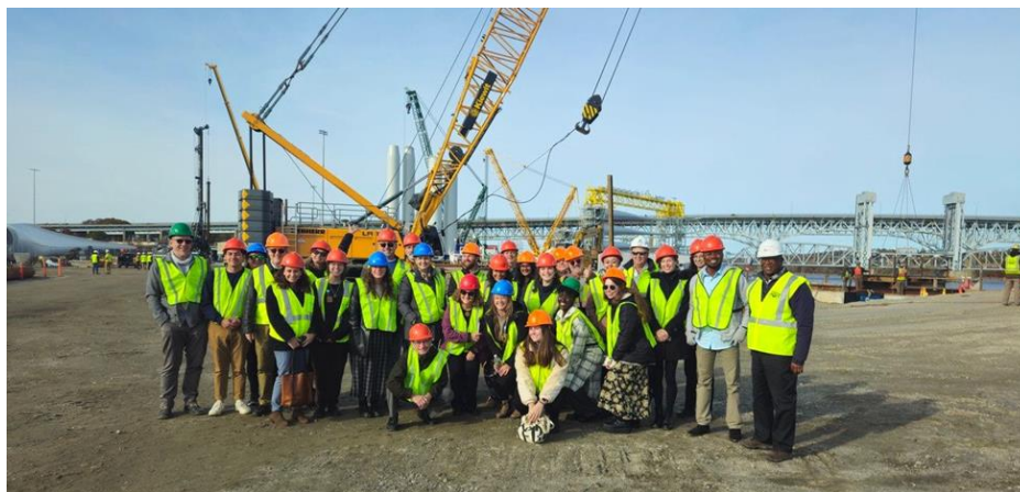
Photo 5. Coastal Transitions III- Field trip participants