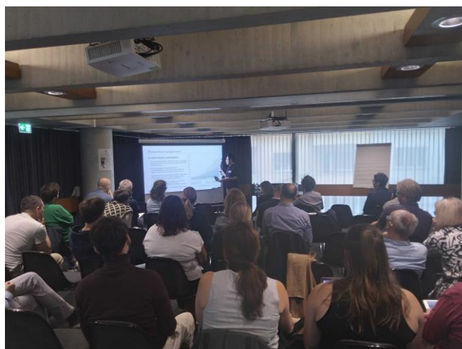
The sessions of the third day were held in Biel