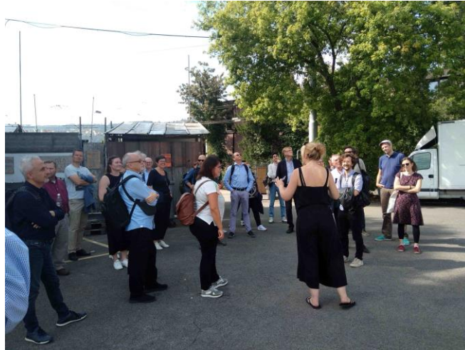
Field trip in Biel: urban redevelopment