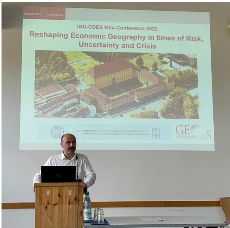
Photo 1 and 2: Welcome and Opening Talk by the Chairperson and Organizer of the IGU CDES conference in Osnabrück, Germany, 5-7 October 2022