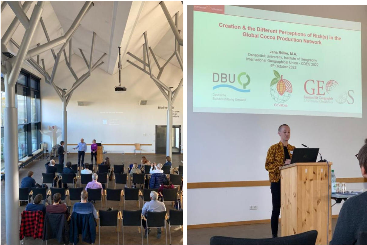
Photo 5: Some of the participants of the IGU CDES conference in Osnabrück, Germany, 5-7 October 2022